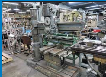
Miscellaneous Toolroom Machinery