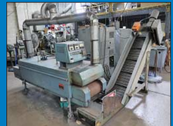
(5) Other Electric Belt Ovens