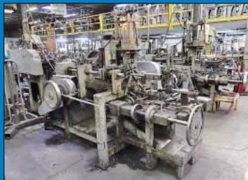
(40) Omiotek Built Torsion, Extension and Tyme Spring Winders to 1/4" and 14" Leg