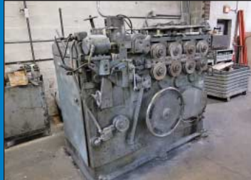
(10) Torin Spring Winders to 1/2", Models W125A, W12A, W115A, W11A, W10