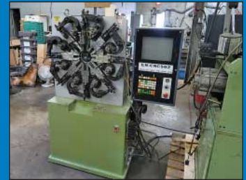
(3) EN Electrical Model CNC-502 Spring Forming Machines