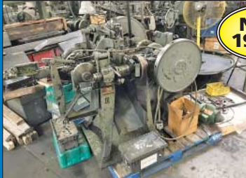
(2) Nilson No. S2F Four-Slides