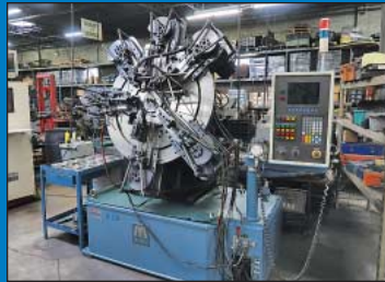
Minyu Model SF-400 CNC Spring Forming Machine