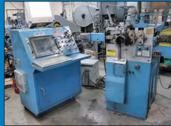
(2) BHS Torin Model 11 CNC Spring Forming Machines