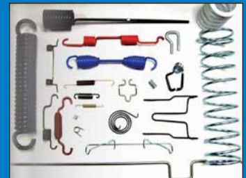
Omiotek Sample Parts