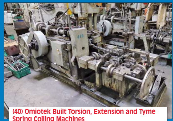
(40) Omiotek Built Torsion, Extension and Tyme Spring Coiling Machines

CINCINNATI INDUSTRIAL AUCTIONEERS auctioneers | appraisers | since 1961