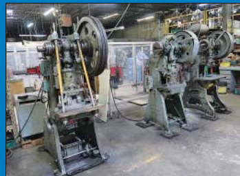
(10) OBI Presses by Bliss, Walsh, Niagara to 60 Ton