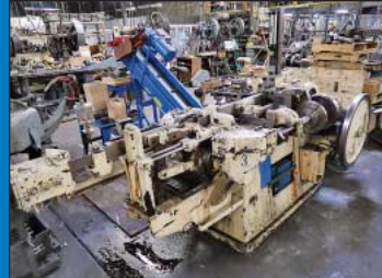
U.S. Baird No. 1 Four-Slide