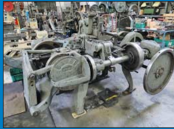
U.S. Baird No. 4 Four-Slide