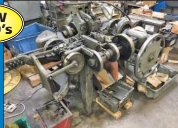
U.S. Baird Multi-Slide