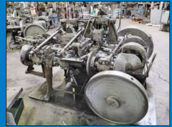
Nilson No. S3F Four-Slide