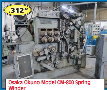
Osaka Okuno Model CM-800 Spring Winder