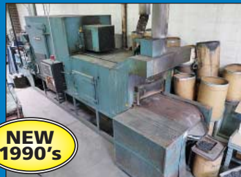
30" Grieve Model Belt Conveyor Natural Gas Fired Oven