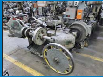
(2) U.S. Baird No. 3-24 Four-Slides