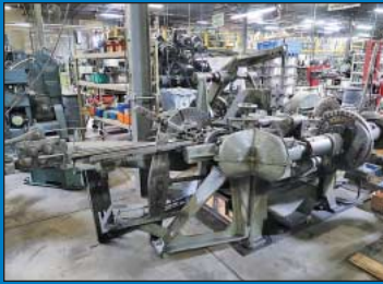
Nilson No. S-426 Long-Feed Four-Slide