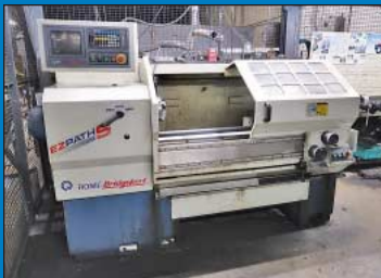
18" x 36" Romi Bridgeport Model EZ-Path Flat Bed CNC Lathe