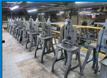
(25) Famco No. 10 Kick Presses