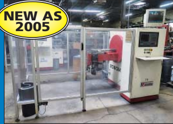
(2) Latour Robomac Model 310 CNC Wire Benders