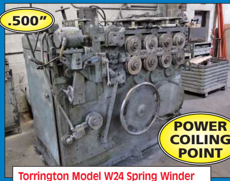
Torrington Model W24 Spring Winder