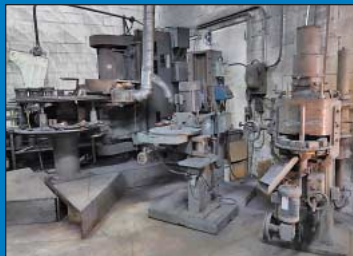
(3) Besly Model 918 and 226 Spring Grinders