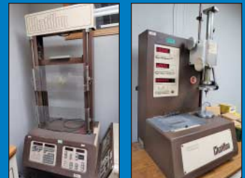
Chatillon Spring Testers

Other Famco Kick Presses No.s 6, 8, 10 and 15