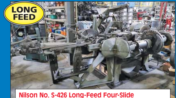
Nilson No. S-426 Long-Feed Four-Slide