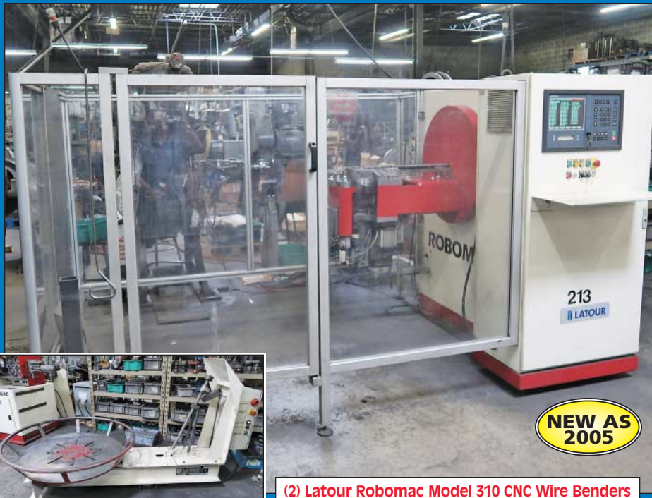
(2) Latour Robomac Model 310 CNC Wire Benders

INSPECTION: Day Prior to Sale or email jeffjr@cia-auction.com for early appointment