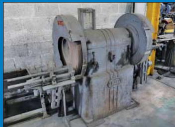
(10) Other Various Size and Style Spring Grinders