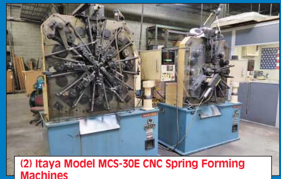
(2) Itaya Model MCS-30E CNC Spring Forming Machines