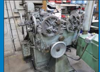
(2) Wafios Spring Winders, Models FOA-41, FOA-2