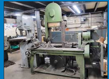
18" Marvel Tilt Frame Vertical Band Saw