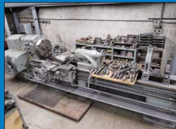
Engine Lathes to 24" x 120"